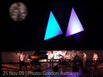
25 Nov 09 | Photo: Gordon Axmann