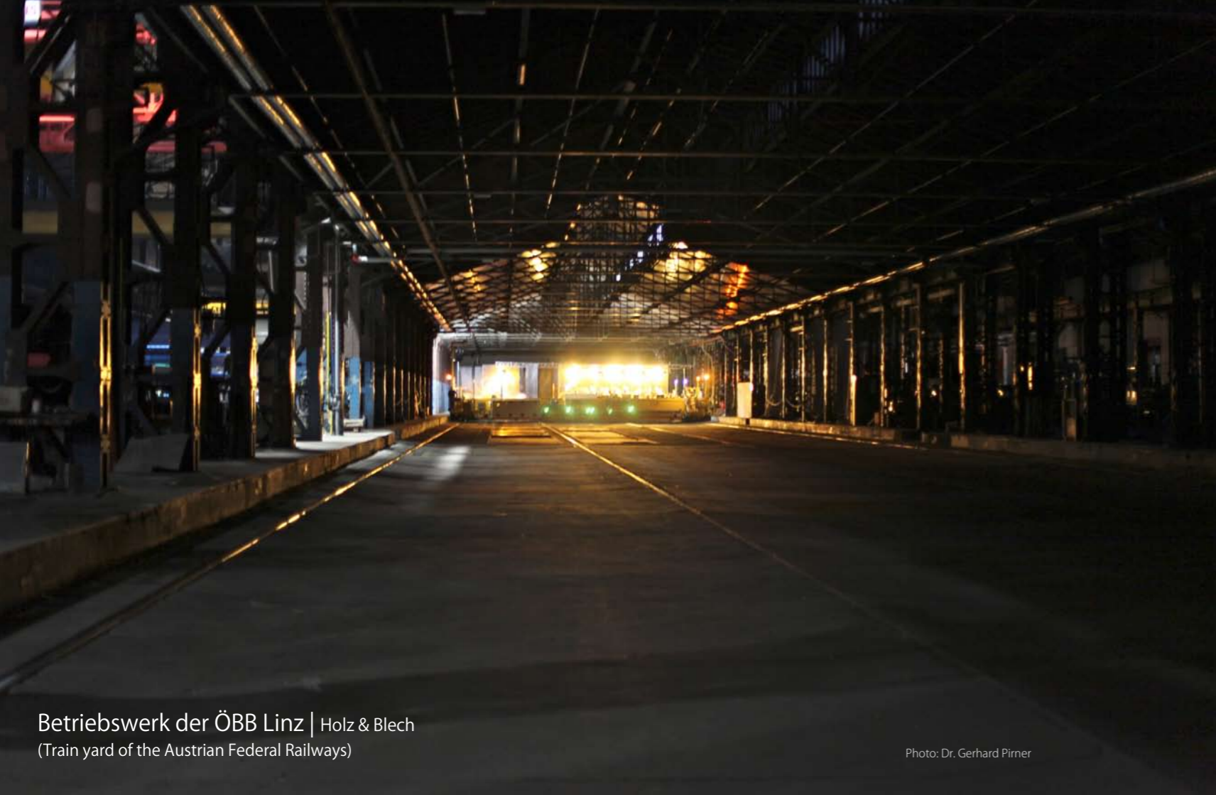
Betriebswerk der ÖBB Linz | Holz & Blech (Train yard of the Austrian Federal Railways)