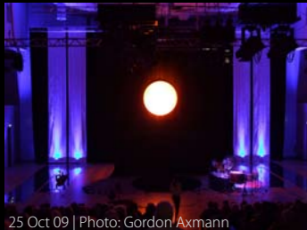
25 Oct 09 | Photo: Gordon Axmann