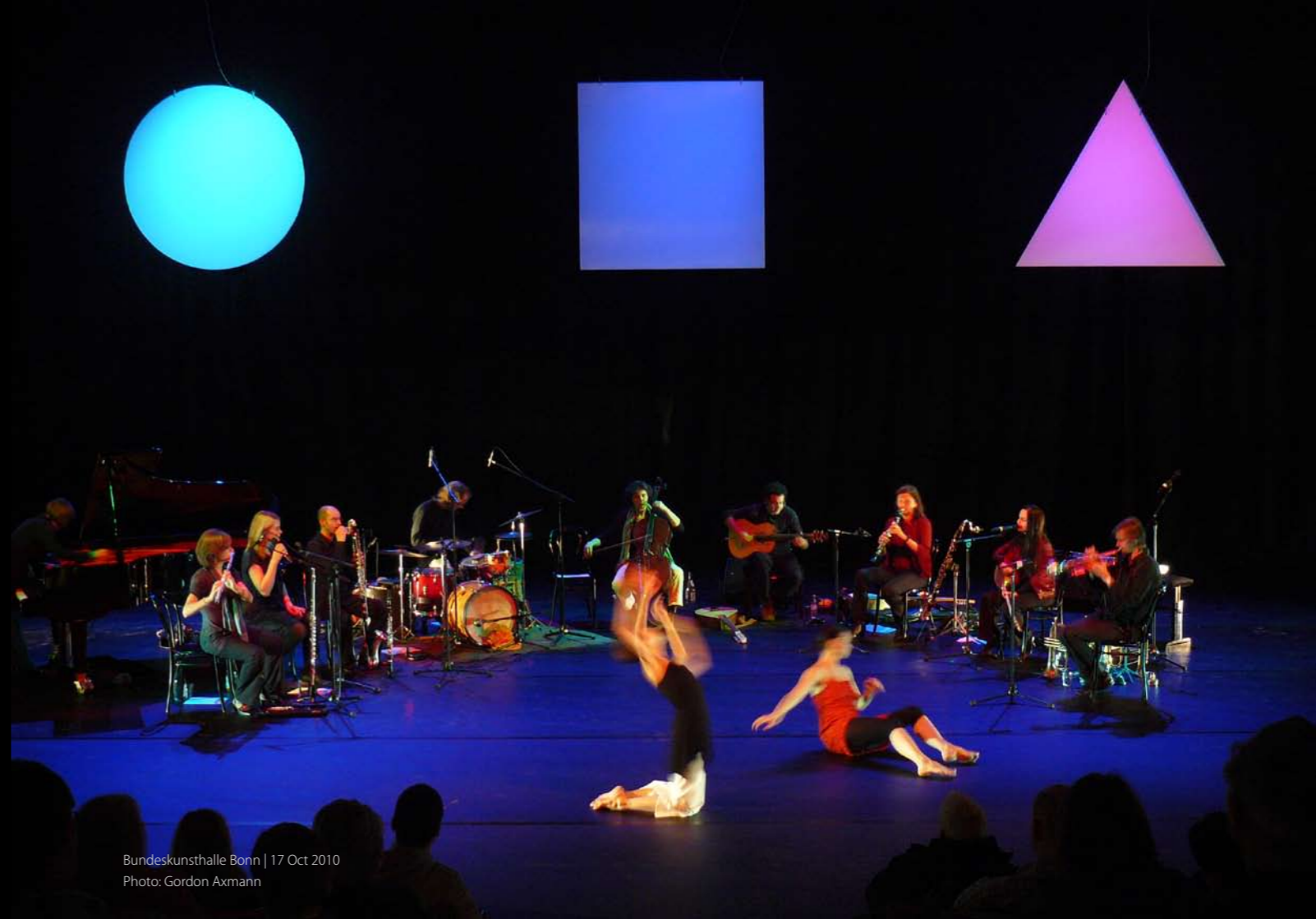
Bundeskunsthalle Bonn | 17 Oct 2010

Tobias Blum, Bonner General-Anzeiger, 27 Oct 2007