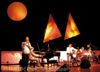
25 Nov 09