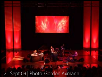
21 Sept 09